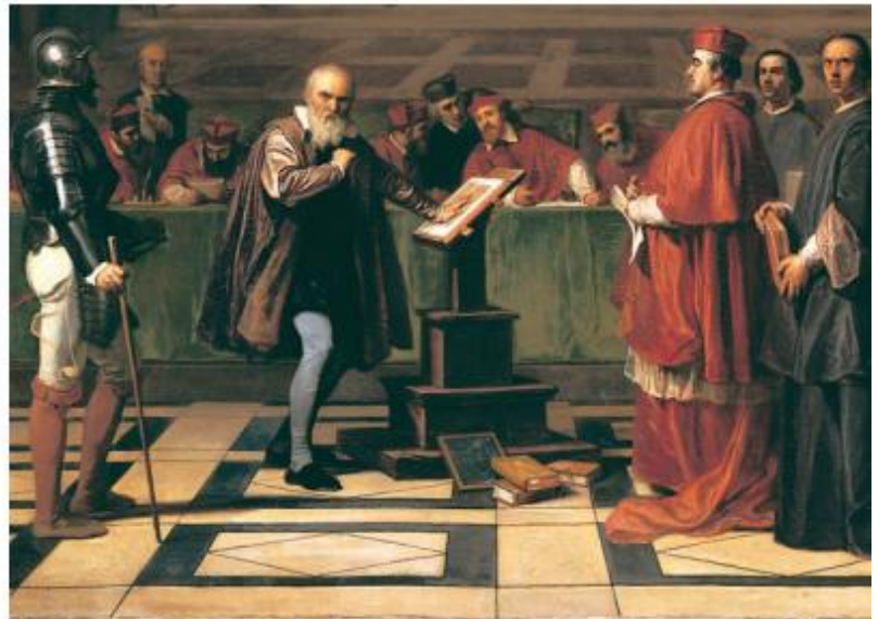
▲ Galileo stands before the papal court.

Galileo was never again a free man. He lived under house arrest and died in 1642 at his villa near Florence. However, his books and ideas still spread all over Europe. (In 1992, the Catholic Church officially acknowledged that Galileo had been right.)